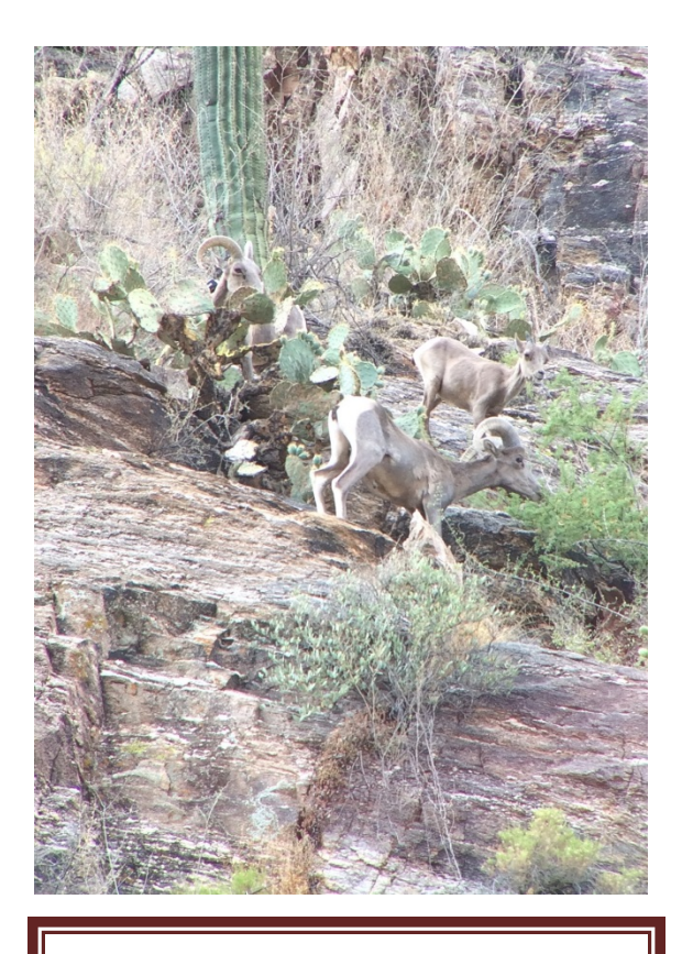
One collared ewe, one uncollared ewe, and a lamb browsing on acacia and prickly pear cactus.

Two collared ewes, one uncollared ewe, and a yearling female.